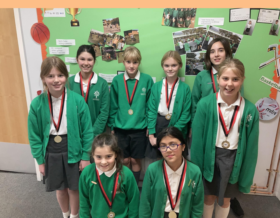
Cross Country Running...