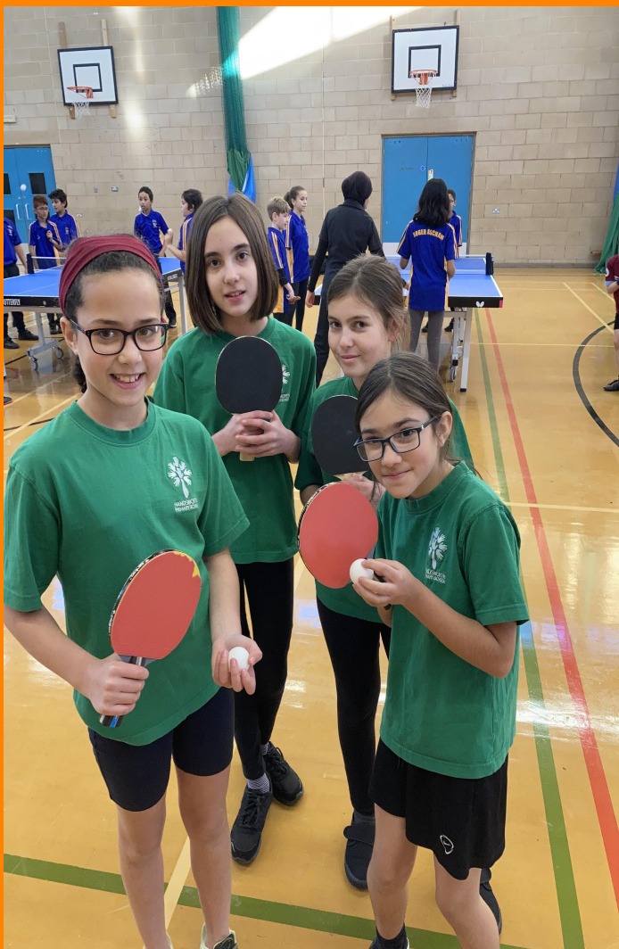
Well done to our table tennis finalists!