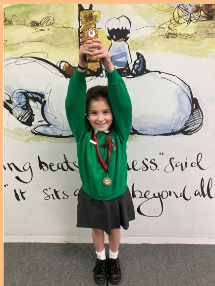
Girls' gold medal for Handsworth